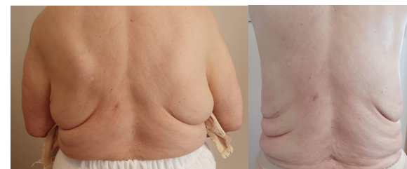
Results from Evie Clark Hair and Beauty Spa, after just 4 treatments.